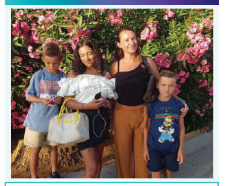
A sense of place in the world